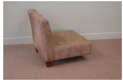
CHAIR WITH ONE ARM