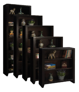
LOFT BOOK CASES

082-06-1000 36" Tall 48" Tall 60" Tall 72" Tall 84" Tall