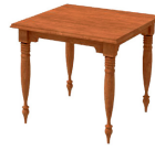
TURNED LEG END TABLE