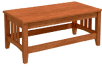
CRAFTSMAN COFFEE TABLE