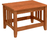
CRAFTSMAN END TABLE