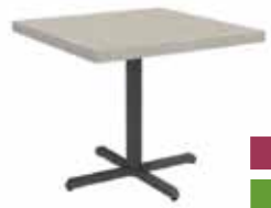
SIERRA TOP MATCHING VINYL EDGE BLACK METAL CROSS BASE