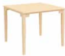
LAMINATE TOP WOOD EDGE 4 LEGS AND APRON