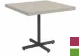
SIERRA TOP MATCHING VINYL EDGE BLACK STEEL TUBE BASE