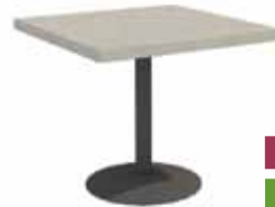
SIERRA TOP MATCHING VINYL EDGE BLACK METAL DISC BASE