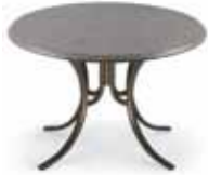
SOLID TOP TABLES