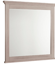
SMALL LANDSCAPE MIRROR