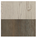
Dove Grey + Folkstone