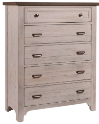
5 DRAWER CHEST