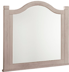
MASTER ARCH MIRROR