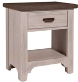
1 DRAWER NIGHTSTAND