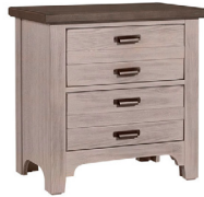
2 DRAWER NIGHTSTAND