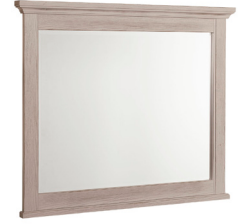
MASTER LANDSCAPE MIRROR