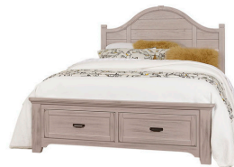
ARCH STORAGE BED