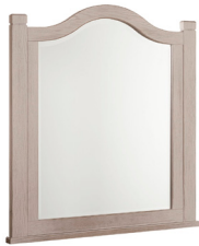
SMALL ARCH MIRROR