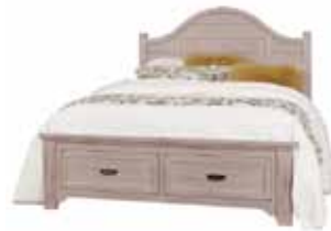
ARCH STORAGE BED