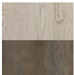
Dove Grey + Folkstone