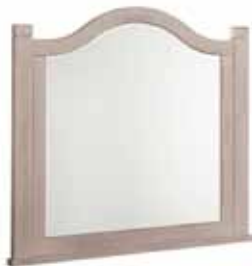
MASTER ARCH MIRROR 117-20-8001 39 x 2 x 35 in