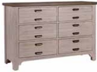
DOUBLE DRESSER 107-20-8000 55 x 20 x 37 in