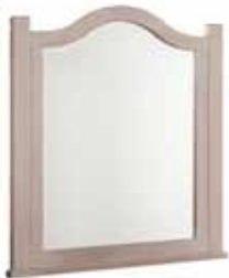
SMALL ARCH MIRROR 116-20-8001 36 x 2 x 38 in