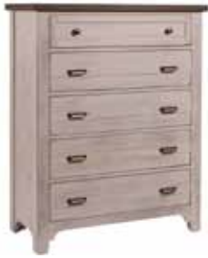
5 DRAWER CHEST 105-20-8000 42 x 20 x 52 in