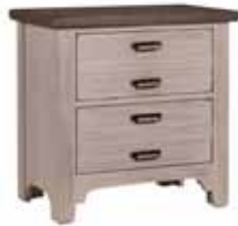
2 DRAWER NIGHTSTAND 112-20-8000 28 x 17 x 27 in