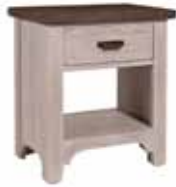
1 DRAWER NIGHTSTAND 111-20-8000 23 x 17 x 25 in