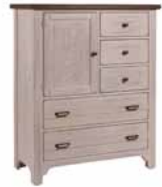
DOOR CHEST 115-20-8000 42 x 20 x 51 in