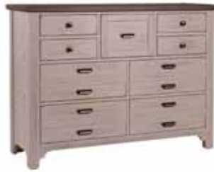
MASTER DRESSER 108-20-8000 59 x 20 x 43 in