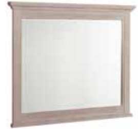
MASTER LANDSCAPE MIRROR 117-20-8000 41 x 3 x 35 in