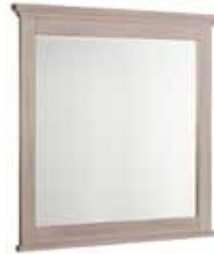
SMALL LANDSCAPE MIRROR 116-20-8000 38 x 3 x 39 in