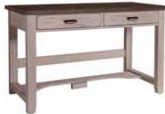
LAPTOP DESK 192-20-8000 52 x 24 x 32 in