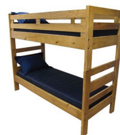
LADDER END BUNK BED