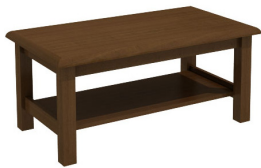
COFFEE TABLE 023-54-7000 40 x 22 x 18 in