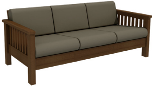
SOFA 003-54-7000 78 x 35 x 29 in