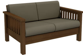
LOVESEAT 005-54-7000 54 x 35 x 29 in