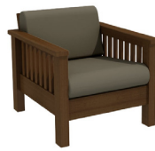
CHAIR 007-54-7000 30 x 35 x 29 in