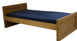
TWIN MATES BED