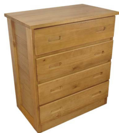
4 DRAWER CHEST