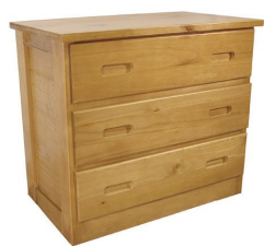
3 DRAWER CHEST