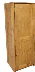
SINGLE WARDROBE 1 SHELF & ROD