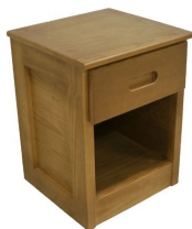
NIGHTSTAND 1 DRAWER