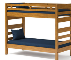
LADDER END BUNK BED