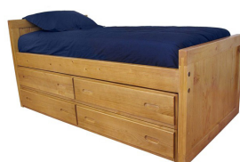
* TWIN ADMIRALS BED