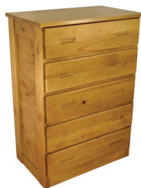
5 DRAWER CHEST