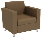
TIGHT BACK - METAL LEG