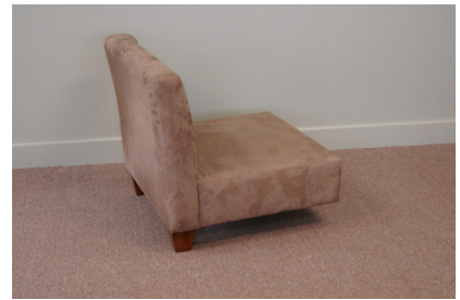
CHAIR WITH ONE ARM