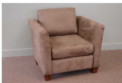
CHAIR COMPLETE WITH CUSHIONS