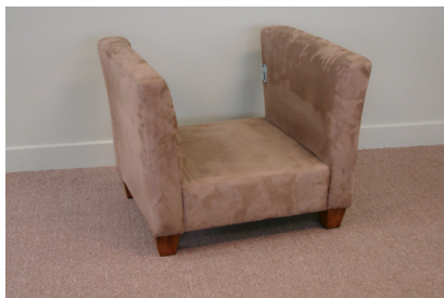
CHAIR WITH TWO ARMS