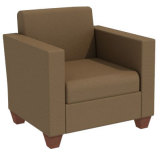
TIGHT BACK - WOOD LEG