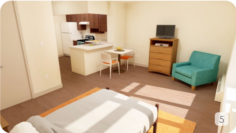
Concept View 1