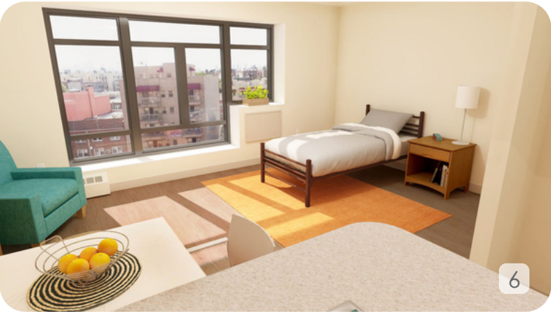
Concept View 2