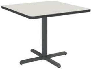
Laminate Table w/ Metal Cross Base