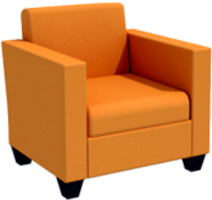
Connections Tight Back Chair