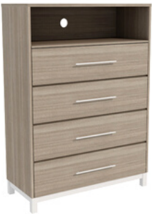
Haven 4 Drawer Media Chest