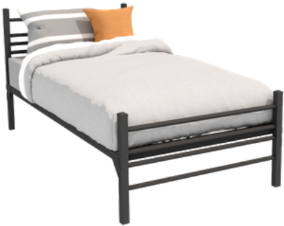
Empire Twin Bed