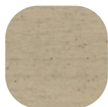
New Age Oak