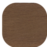
Uptown Walnut Heights