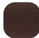
Warm Columbian Walnut