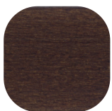
Wild Montana Walnut