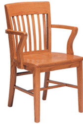
SCHOOLHOUSE ARM CHAIR 221-24-3010 24 x 22 x 35 in