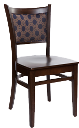
KENMORE SIDE CHAIR WOOD SEAT/UPHOLSTERED BACK 220-29-2000 17 x 20 x 35 in