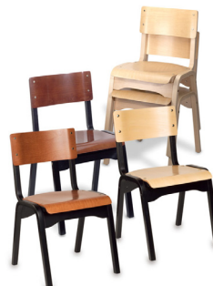
CARLO STACK CHAIR 220-41-2000 17 x 19 x 32 in