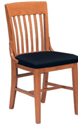
SCHOOLHOUSE SIDE CHAIR 220-24-3010 18 x 21 x 35 in