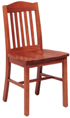
INWOOD 220-24-3530 18 x 20 x 34 in