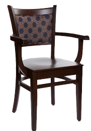
KENMORE ARM CHAIR WOOD SEAT/UPHOLSTERED BACK 221-29-2000 22 x 20 x 35 in