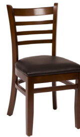
BEDFORD II SIDE CHAIR 220-25-6000 18 x 20 x 34 in