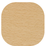
Natural Frame Natural Seat/Back