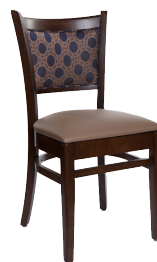
KENMORE SIDE CHAIR UPHOLSTERED SEAT & BACK 220-29-2100 17 x 19 x 35 in