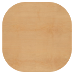
Ale Light Coordinate