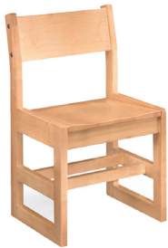
BAYRIDGE SIDE CHAIR 220-24-0190 19 x 21 x 32 in