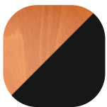
Black Frame Wild Cherry Seat/Back