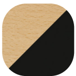
Black Frame Natural Seat/Back