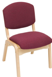
CAMPUS STACK CHAIR 220-41-1000 18 x 23 x 33 in