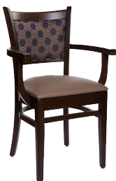
KENMORE ARM CHAIR UPHOLSTERED SEAT & BACK 221-29-2100 22 x 19 x 35 in