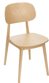
LOCKPORT SIDE CHAIR 220-25-5000 18 x 21 x 34 in