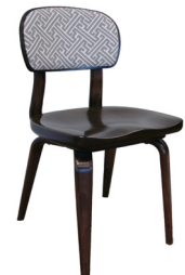
KRISTI SIDE CHAIR 220-41-3000 17 x 23 x 32 in