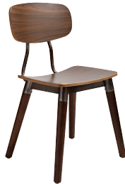
AURORA SIDE CHAIR 220-29-1000 20 x 19 x 33 in