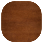
Bourbon Light Coordinate