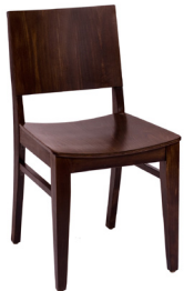
MANHATTAN SIDE CHAIR 220-25-3000 18 x 20 x 33 in