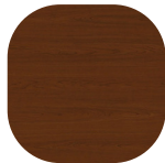
Brighton Light Coordinate