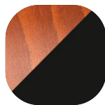
Black Frame Mahogany Seat/Back