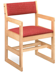
BAYRIDGE ARM CHAIR 221-24-0120 21 x 21 x 32 in