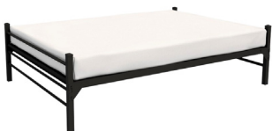
TWO FOOTBOARDS WITH METAL SIDE RAILS