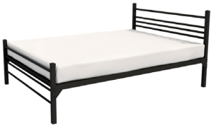
HEADBOARD/FOOTBOARD WITH SPRINGBASE