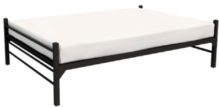
2 FOOTBOARDS WITH SPRINGBASE