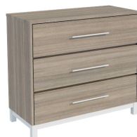
3 DRAWER CHEST