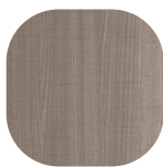
5th Ave. Elm