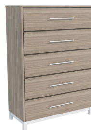
5 DRAWER CHEST