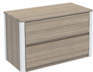
2 DRAWER UNDERBED CHEST