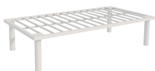
TWIN STEEL PLATFORM BED