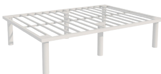
FULL STEEL PLATFORM BED