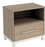
1 DRAWER NIGHTSTAND