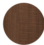
F165 Modern Walnut