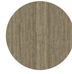
F258 Rustic Walnut