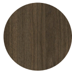
F157 Modern Teak