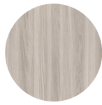
F306 Mineral Grey