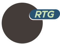
M240-PC Shadow Grey