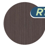
F181 Driftwood Grey