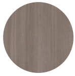
F187 Smoky Grey