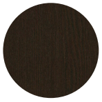
F762 Shadow Oak