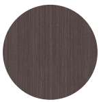
F181 Driftwood Grey