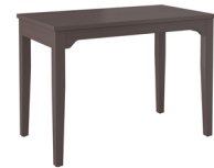
Table Desk ADA