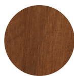
F068 Wild Cherry