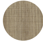
F282 Fog Mist